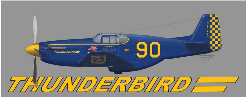
Jackie Cochran's THUNDERBIRD Air Racer