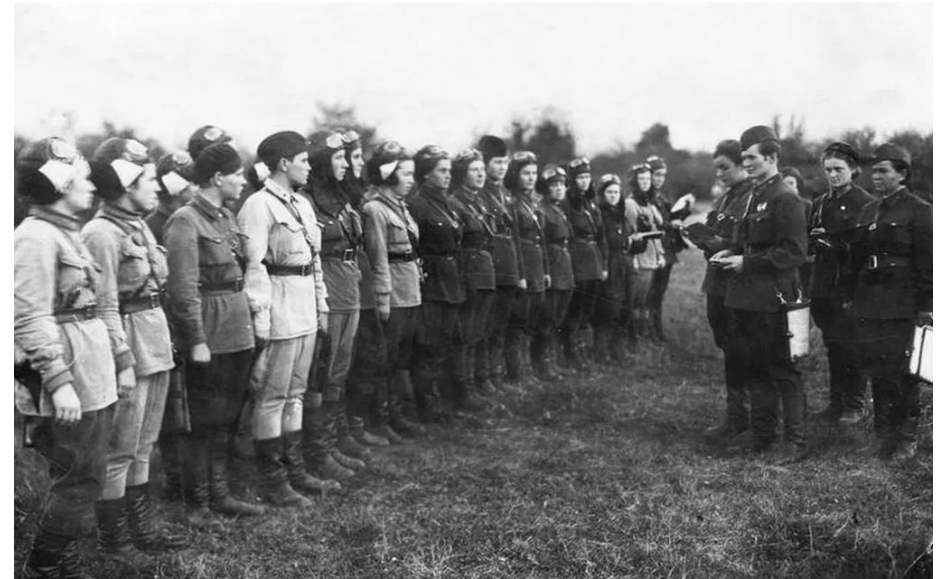
Line up of "The Night Witches"